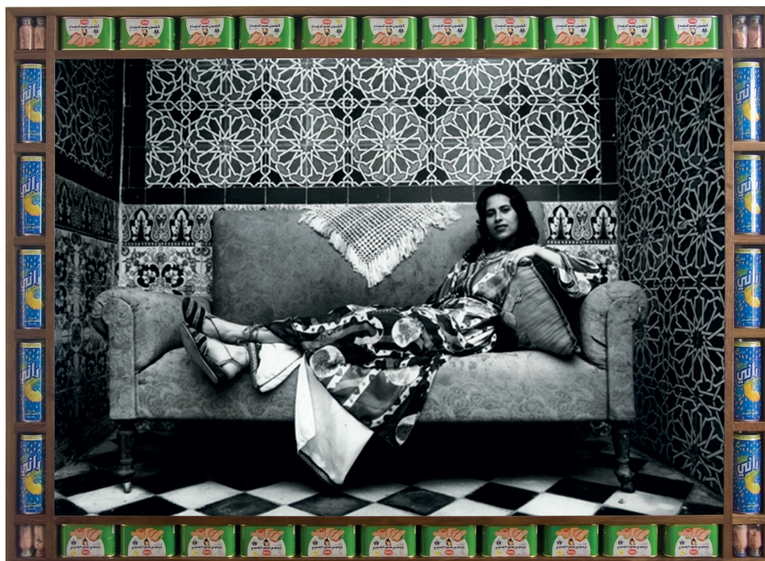
Hassan Hajjaj, Illham, 200/1421 , Digital C-Print, 129 x 94 cm

BALAD_E: Balad is an ancient Arabic word; it refers to a town, city or country but also to the process of civilization. An E is added to the word BALAD, it forms the French word "Balade" witch means a stroll. BALAD_E is a stroll into the "no carbon" world, in a joyful way, through the past and the future.